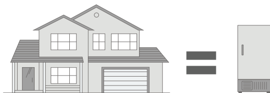
Standard ULT Energy Consumption

Legacy, compressor-based ULT freezers demand large amounts of power to operate in the lab, consuming as much electricity as the average U.S. household. Stirling Ultracold ULT freezers use up to 75% less energy to operate than standard compressor-based systems and sacrifice neither performance nor reliability. This is due to the inherent efficiency of their innovative free-piston Stirling Ultracold engine technology, which is at the heart of our ULT freezers.