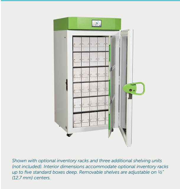
Shown with optional inventory racks and three additional shelving units (not included). Interior dimensions accommodate optional inventory racks up to five standard boxes deep. Removable shelves are adjustable on 1/2" (12.7 mm) centers.